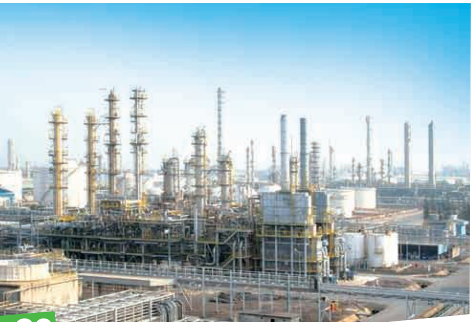
The Map Ta Phut site (Thailand), producing PVC and hydrogen peroxide, certified ISO 14001