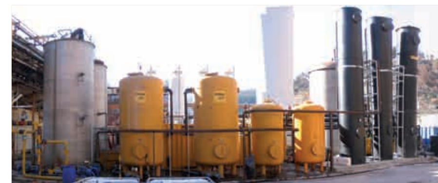
Units to treat contaminated underground water at Bussi sul Tirino (Italy)

The technical solutions for protecting underground and surface water resources vary considerably. Düsseldorf (Germany) provides a good example of a project that is soon to be completed. The site has been acquired in 1965 and has ceased activity in 1998. Soil remediation began there in 1996. The good results obtained and precise monitoring of what was happening in the subsoil made it possible to hand over the land with authorization for it to be built on.